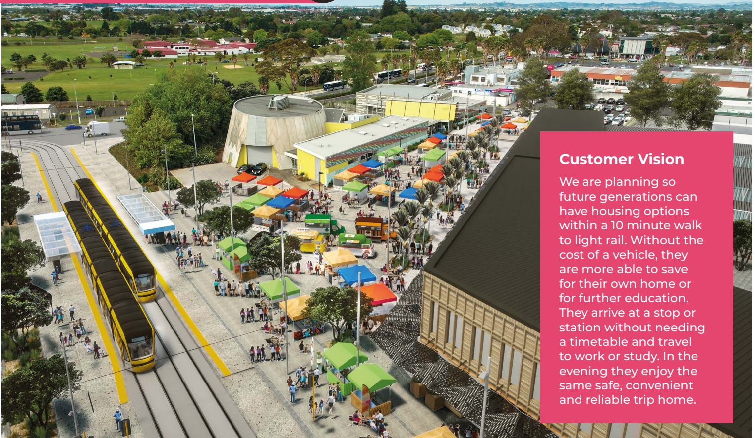
Artist's impression only – Māngere Town Centre.