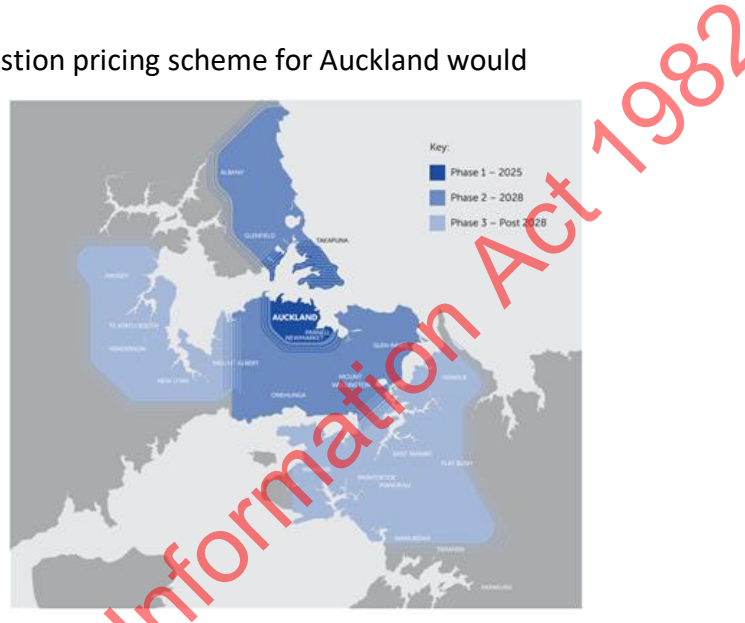
Figure 1: Phased implementation as recommended by The Congestion Question

The Congestion Question (TCQ) identified the City Centre Cordon and Strategic Corridors options as having the most potential for Auckland. It also recommends a phased implementation of congestion pricing, starting as early as 2025. However, no date has been set by Government for a decision to proceed and no funding has been committed for its implementation through the RLTP. It is therefore recommended to that the CC2M project <u>exclude</u> road pricing from its Do Minimum scenario as it is not a committed nor a funded project at this stage.